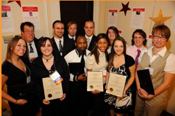
Granite State Leaders 2008-2009